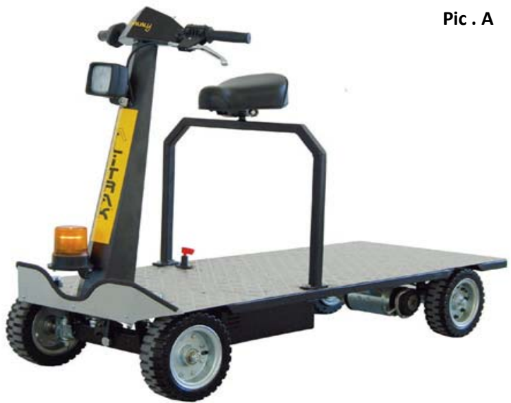
Pic . A