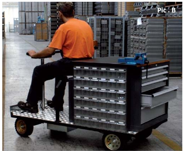
Pic . B