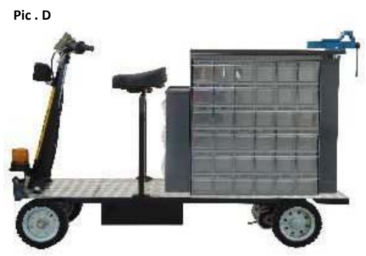
Pic . D