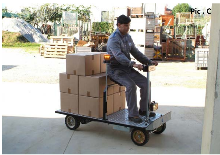
Pic . C